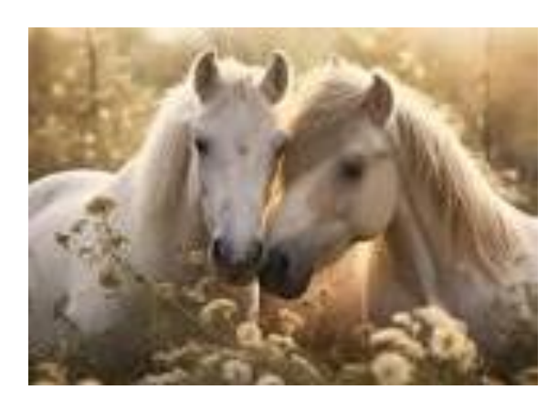
No need to fight if you don't want to.

An offer of a draw may be ventured at any time, without requirement for a specific number of moves to have been made.