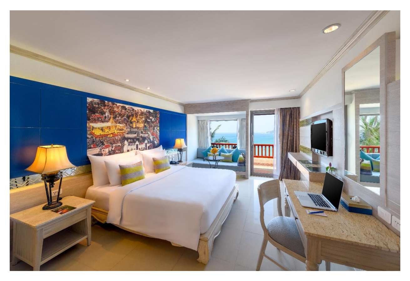
Guest rooms at Novotel Phuket Resort are quiet and well appointed.

The tournament playing room is accessed by a short walk up a steep hill. Although players are welcome to undertake this climb by foot if they so prefer, a continuous tuk-tuk shuttle service will operate from the base of the hill from 30 minutes before each round.