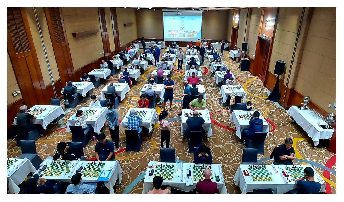
Trophies and Medals

Prizes will not be shared. Ties will be broken by applying the tie breaking procedures indicated on the tournament's page at chess-results.com.