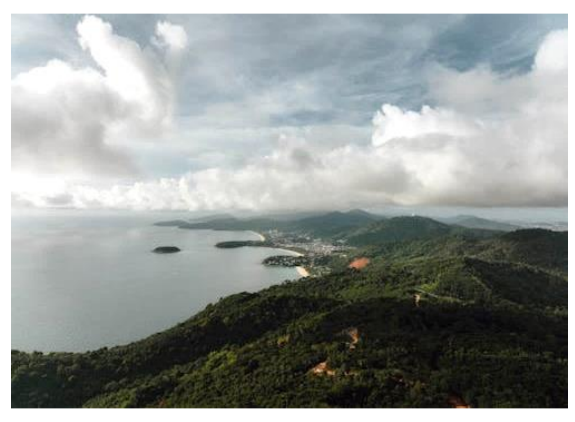
Patong Beach is the most central of the three beaches pictured.