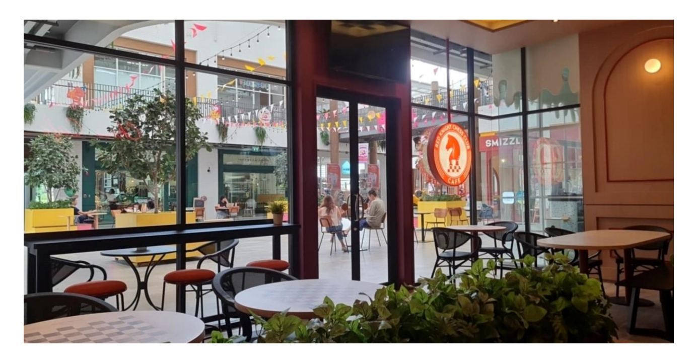
In August 2024, the Red Knight Chess Café was opened. With a new, modern design, this chess themed coffee shop is a must-stop place for chess players from all around the world, when visiting or passing through Bangkok.